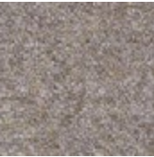
SY Fabric 11 Colours