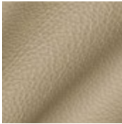
N Ecological leather 13 Colours