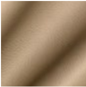
Cl_CX Ecological leather 13 Colours