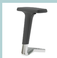
2D (two directions) adjustable armrests