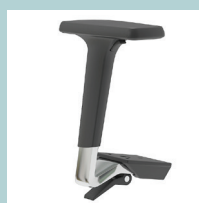
3D (three directions) adjustable armrests