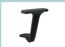
2D armrests, lower part – plastic