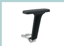
2D armrests, lower part – aluminium