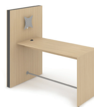
Media wall (1200x132, H=1860 mm) with VESA mount and fixed high table (1800x800, H=1050 mm) CMM190