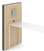
Media wall** with VESA mount CMZ124