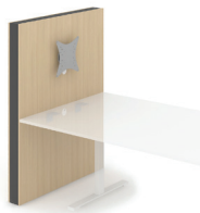
Media wall* with VESA mount and round Ø60 mm plastic cable port under the tabletop for wire management CMZ121