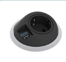
Power socket SHZ004 (EU, UK, FR, CH)