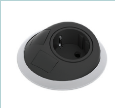
Power socket SHZ005 (EU, UK, FR, CH)