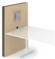
Media wall* with VESA mount CMZ123