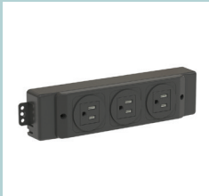
Power socket block set for media (EU, UK, FR, CH)